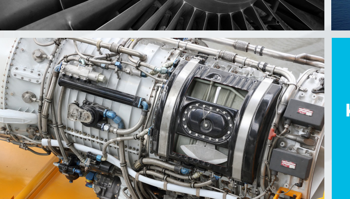
KOBE - JAPAN KOBE CONVENTION CENTER October 25-26, 2022

UNIQUE EVENT DEDICATED TO INTERNATIONAL BUSINESS CONVENTION FOR AERO ENGINES, GAS TURBINES & PROPULSION EQUIPMENT